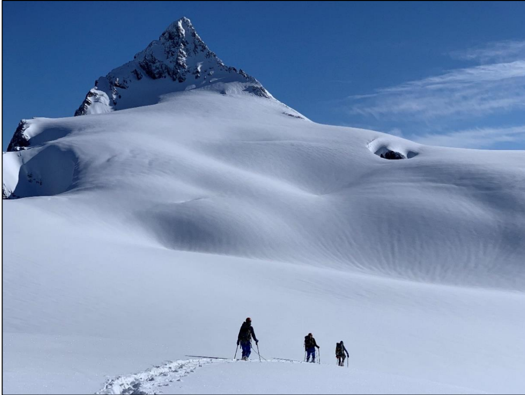
IMG climbers on the Sulphide Glacier (Max Bond)

WASHINGTON | NORTH CASCADES | 4 DAYS | 9,127'